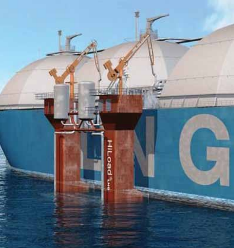
The HiLoad unit docks onto the side of the LNG carrier and helps maintain optimal positioning during the unloading process. After regasification onboard the HiLoad, the gas moves through a flexible gas riser to the nearby Floating Regasification Unit and then to existing area pipelines.