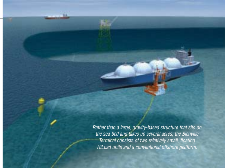
Rather than a large, gravity-based structure that sits on the sea-bed and takes up several acres, the Bienville Terminal consists of two relatively small, floating HiLoad units and a conventional offshore platform.

Secondly, the design and technology of Bienville's unique HiLoad technology is less invasive than other proposed facilities. More than seven years and 30,000 man-hours have gone into the design and engineering of the Bienville Terminal. Rather than a large, gravity-based structure that sits on the sea-bed and takes up several acres, the Bienville Terminal consists of two